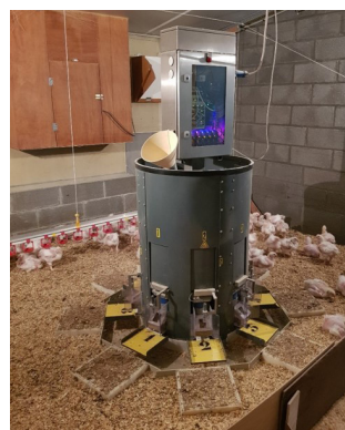
Individual feeding device for group-housed broilers